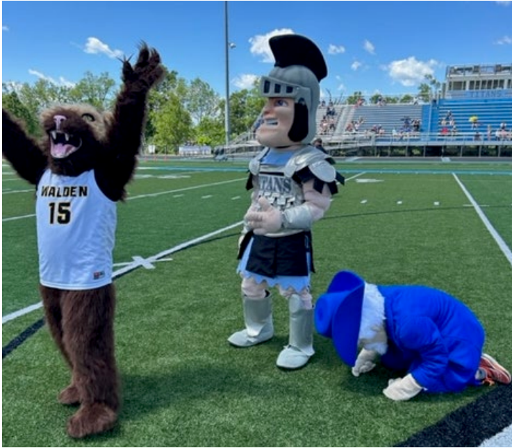
Mascots from Walden, Collins, and Oldham County celebrate after the Mascot 50 yard dash at the Bojangles Bullskin Relays.

Collins' next meet is the 3A Region 4 meet at Collins on May 20 th . Events start at 5:30 PM.