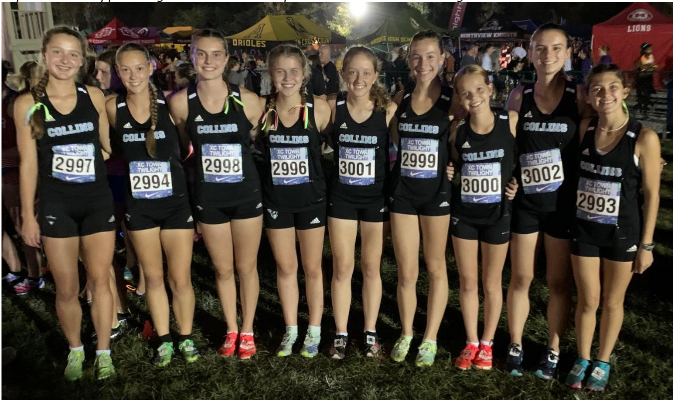
Collins girls before they "tow the line" in the Girls Race of Champions at Nike Twilight.